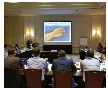
participate in interactive case studies