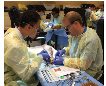
practice nerve repair techniques

“Patient Access in Nerve Repair – Coverage & Payment is Evolving” at 7:00pm on Friday, October 16; attendance optional, location to be announced.