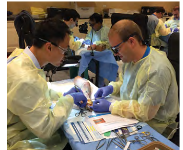
practice nerve repair techniques

Gain insights from clinical faculty on practical surgical approaches