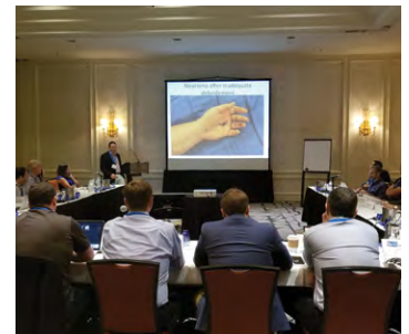
participate in interactive case studies